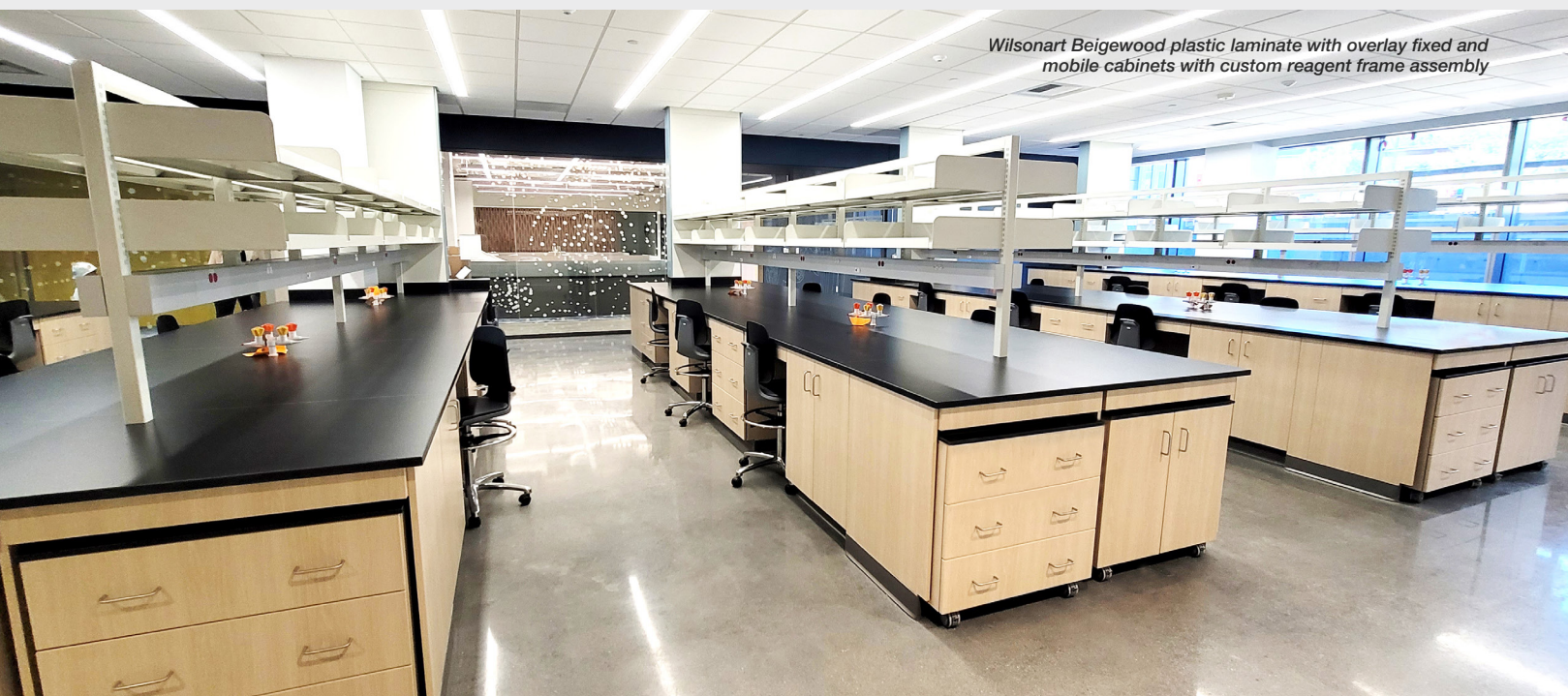
Wilsonart Beigewood plastic laminate with overlay fixed and mobile cabinets with custom reagent frame assembly

High Pressure Vertical Laminate with 1/8" PVC edge banding brings a very broad range of appearances to Mott's pallet of cabinetry.