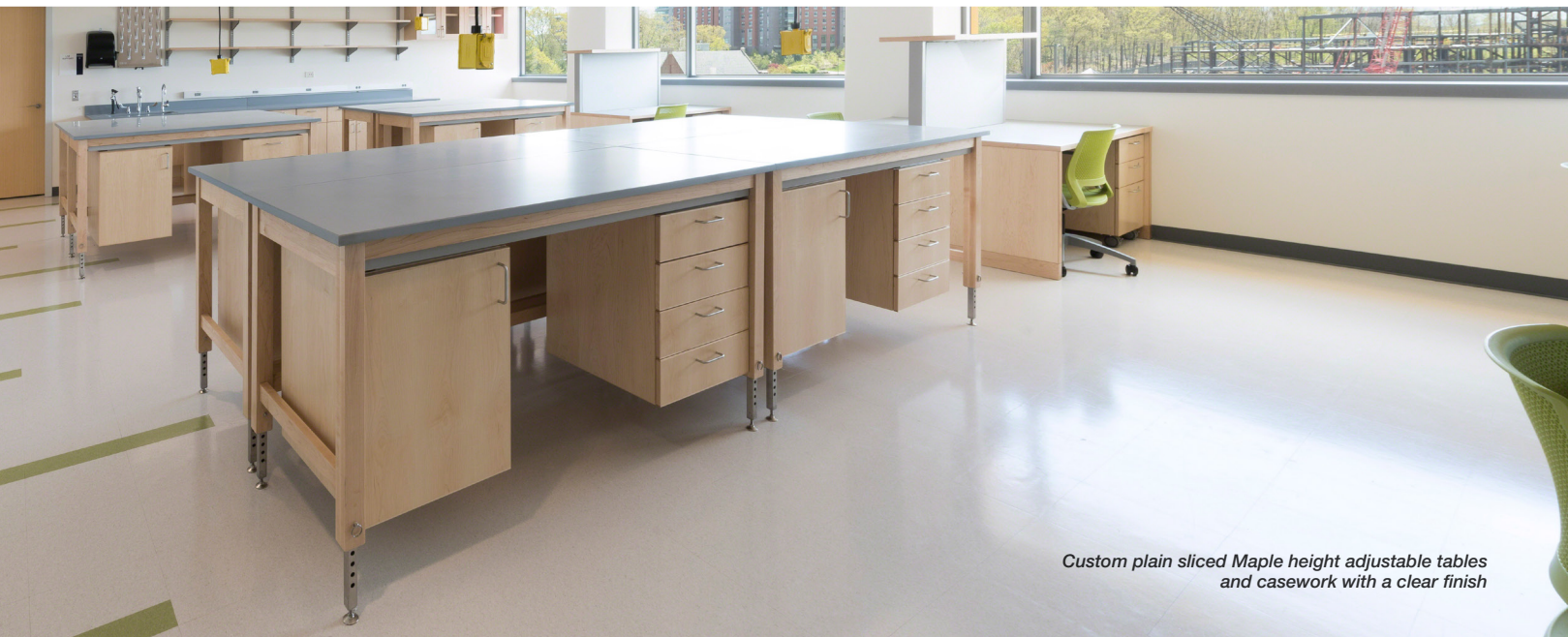
Custom plain sliced Maple height adjustable tables and casework with a clear finish