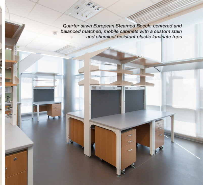
Quarter sawn European Steamed Beech, centered and balanced matched, mobile cabinets with a custom stain and chemical resistant plastic laminate tops