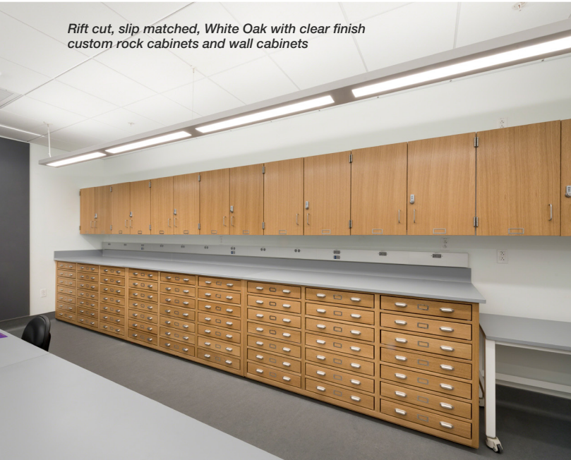
Rift cut, slip matched, White Oak with clear finish custom rock cabinets and wall cabinets

Choose from casework selections to future-proof your laboratory and adapt to changes you've anticipated or that are unexpected. We offer cabinets that are fixed in place, slide-in with glides, suspended, or mobile on locking casters for different levels of storage and flexibility. Whatever your adaptability needs are, Mott has a solution.