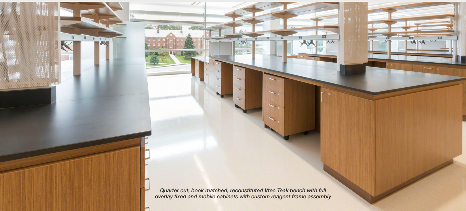
Quarter cut, book matched, reconstituted Vtec Teak bench with full overlay fixed and mobile cabinets with custom reagent frame assembly

Real wood from sustainable forests engineered and manufactured to offer a huge variety of looks with color consistency that greatly exceeds traditionally sliced veneers.