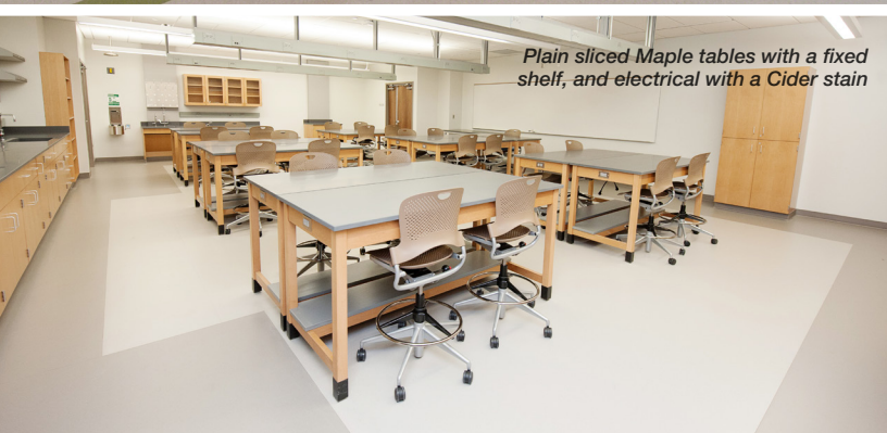
Plain sliced Maple tables with a fixed shelf, and electrical with a Cider stain