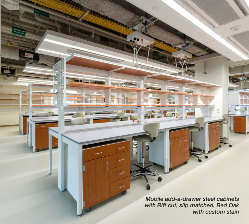
Mobile add-a-drawer steel cabinets with Rift cut, slip matched, Red Oak with custom stain