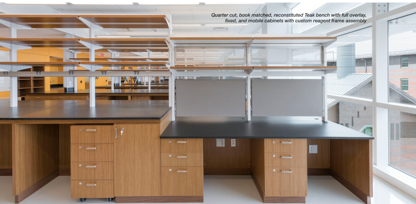
Quarter cut, book matched, reconstituted Teak bench with full overlay, fixed, and mobile cabinets with custom reagent frame assembly

All of our base cabinets are available with heavy-duty locking casters providing convenient storage and mobility. Reconfigure the storage space as your tasks change for maximum flexibility.