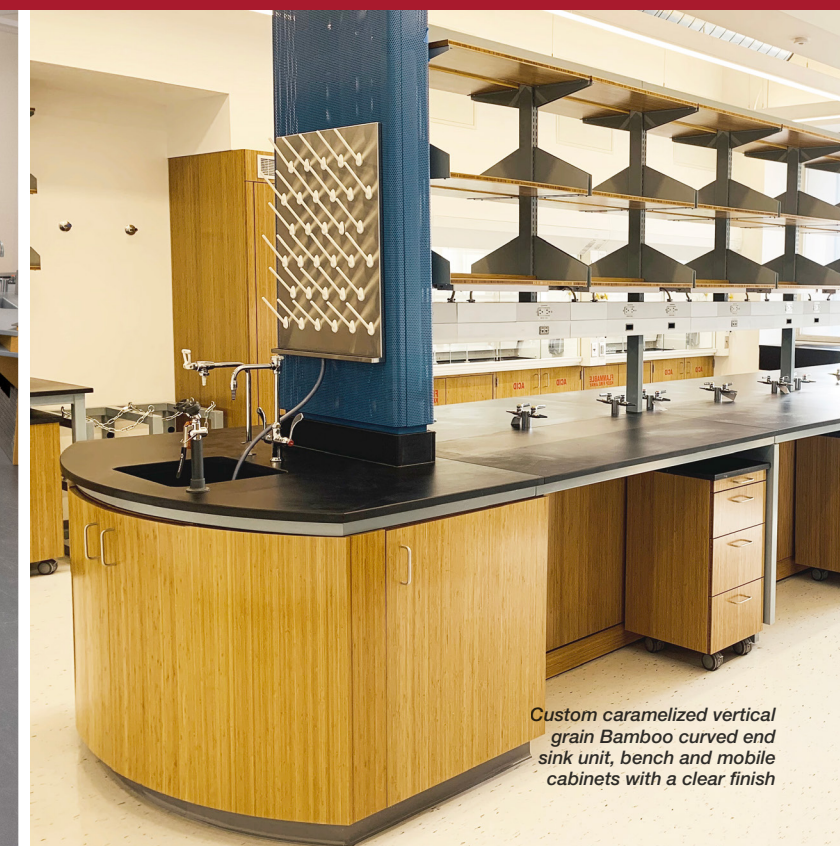
Custom caramelized vertical grain Bamboo curved end sink unit, bench and mobile cabinets with a clear finish