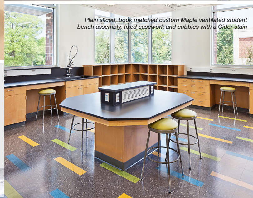
Plain sliced, book matched custom Maple ventilated student bench assembly, fixed casework and cubbies with a Cider stain