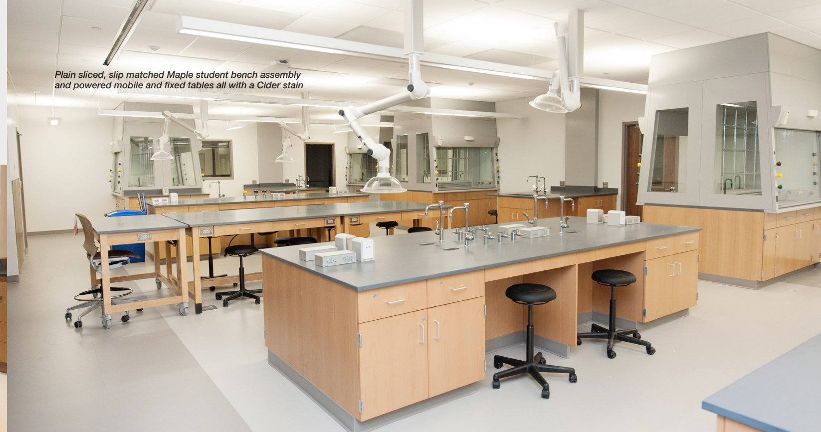
Plain sliced, slip matched Maple student bench assembly and powered mobile and fixed tables all with a Cider stain