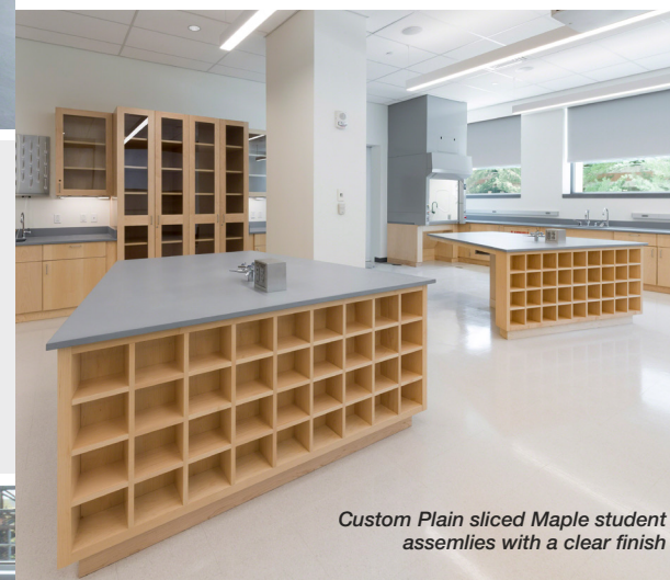
Custom Plain sliced Maple student assemblies with a clear finish

Tables and mobile cabinets move effortlessly around the lab; supporting open labs. As your lab's needs change, our mobile solutions are flexible and dynamic, supporting organization and efficiency wherever work needs to get done with a range of smart options.