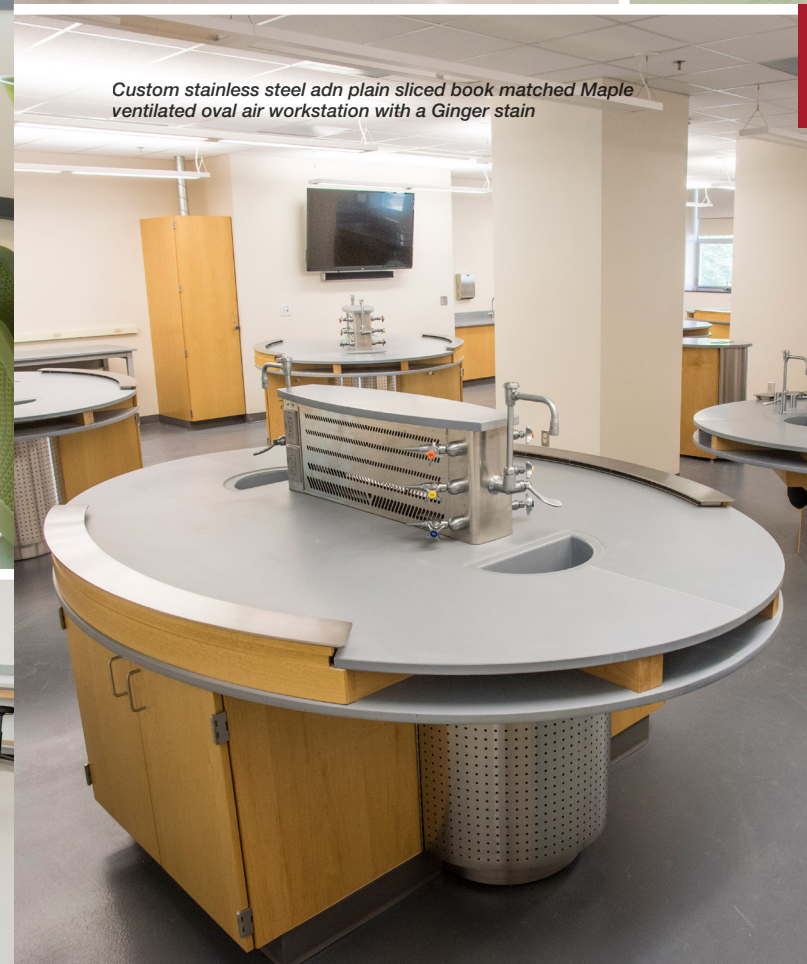
Custom stainless steel and plain sliced book matched Maple ventilated oval air workstation with a Ginger stain