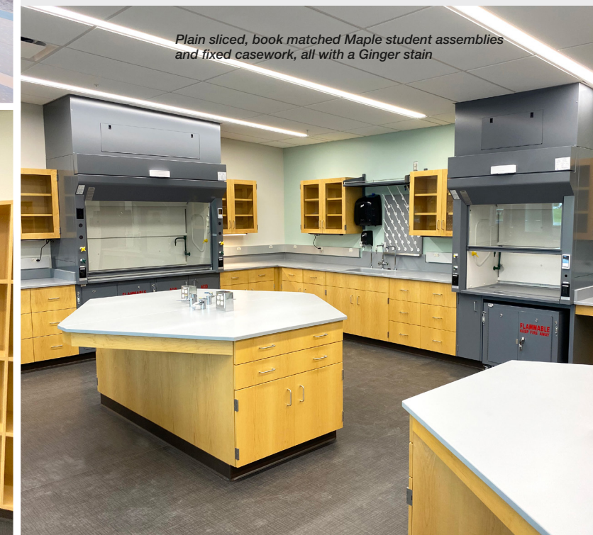
Plain sliced, book matched Maple student assemblies and fixed casework, all with a Ginger stain