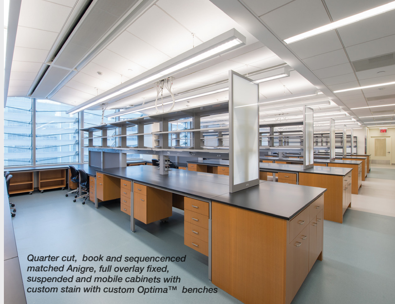
Quarter cut, book and sequenced matched Anigre, full overlay fixed, suspended and mobile cabinets with custom stain with custom Optima™ benches