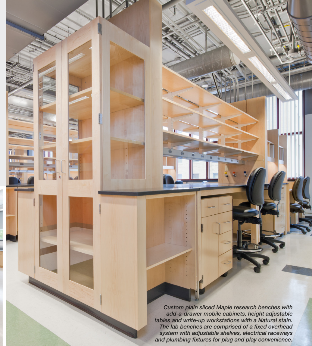
Custom plain sliced Maple research benches with add-a-drawer mobile cabinets, height adjustable tables and write-up workstations with a Natural stain. The lab benches are comprised of a fixed overhead system with adjustable shelves, electrical raceways and plumbing fixtures for plug and play convenience.

When a cataloged item simply won't work in your lab, our team is ready to help develop a custom solution just for you. We're always ready to innovate, and we will customize your design whether you need just one piece or hundreds.