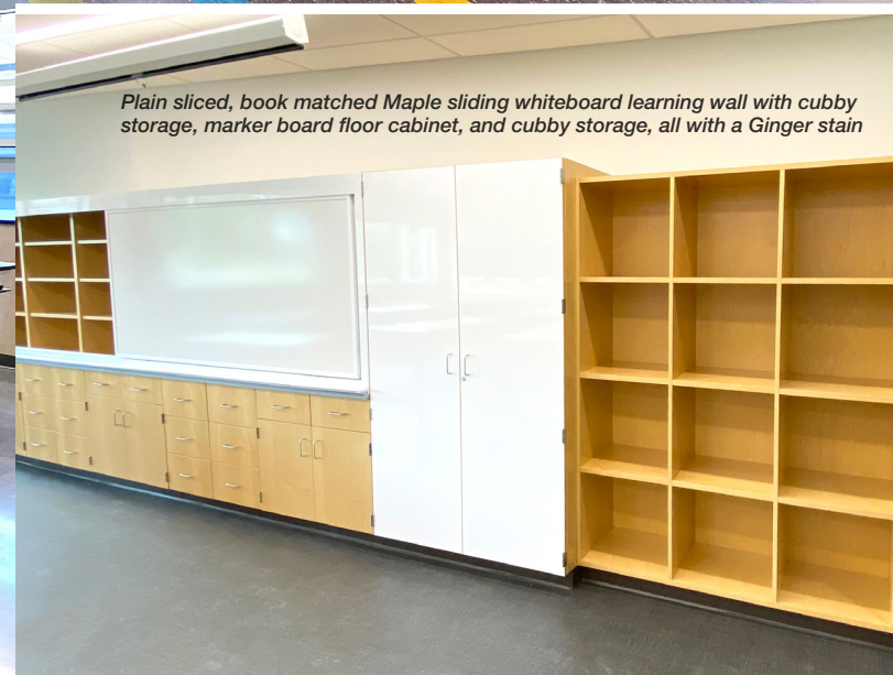
Plain sliced, book matched Maple sliding whiteboard learning wall with cubby storage, marker board floor cabinet, and cubby storage, all with a Ginger stain