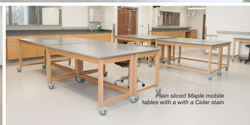
Plain sliced Maple mobile tables with a with a Cider stain