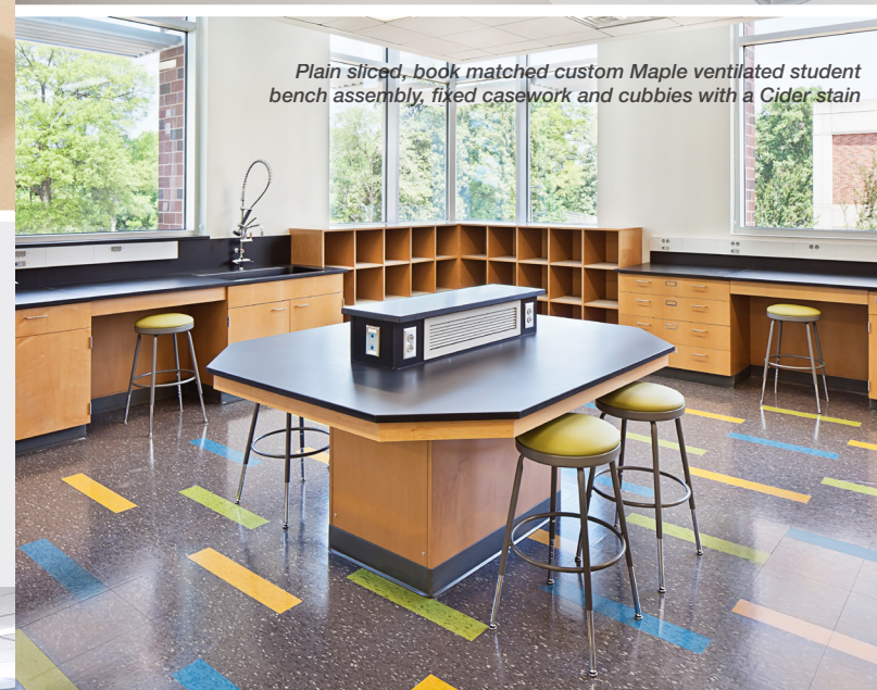
Plain sliced, book matched custom Maple ventilated student bench assembly, fixed casework and cubbies with a Cider stain