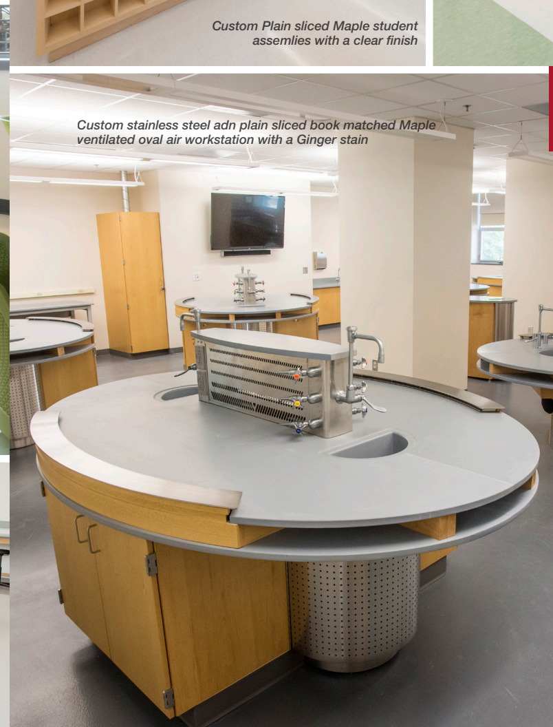
Custom stainless steel adn plain sliced book matched Maple ventilated oval air workstation with a Ginger stain