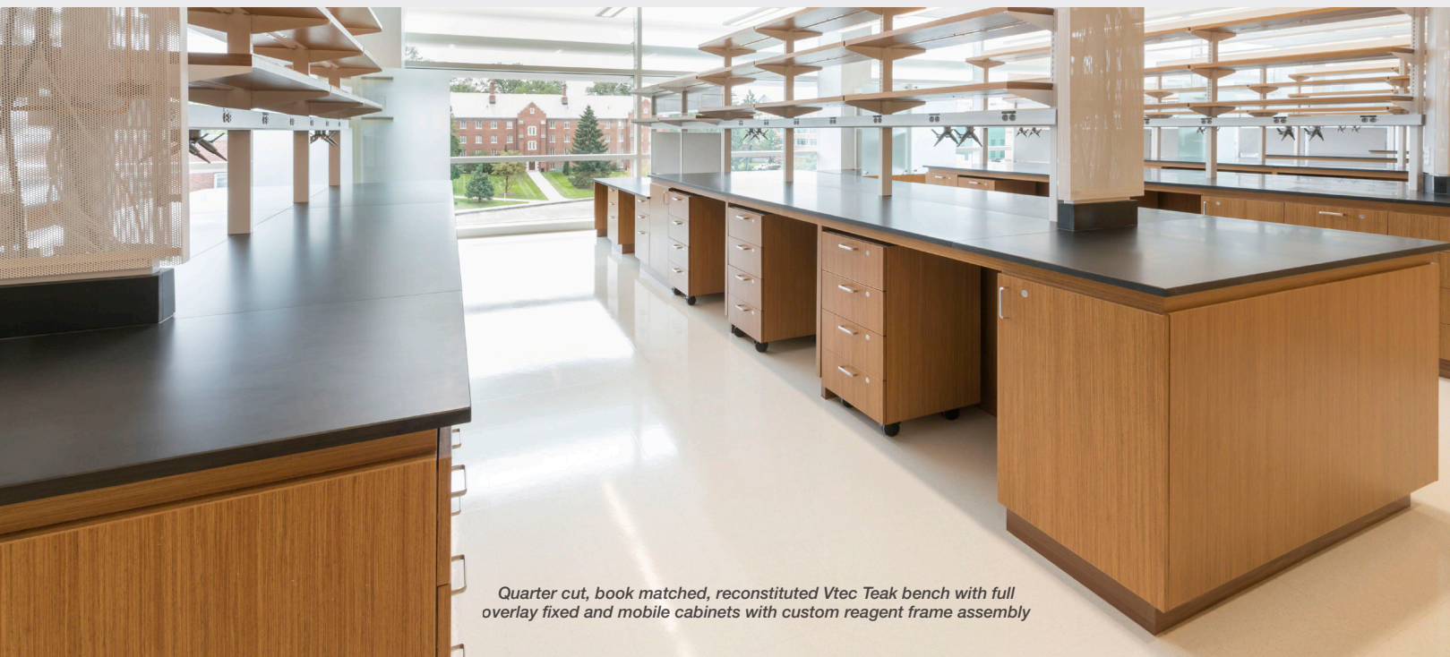
Quarter cut, book matched, reconstituted Vtec Teak bench with full overlay fixed and mobile cabinets with custom reagent frame assembly

Real wood from sustainable forests engineered and manufactured to offer a huge variety of looks with color consistency that greatly exceeds traditionally sliced veneers.