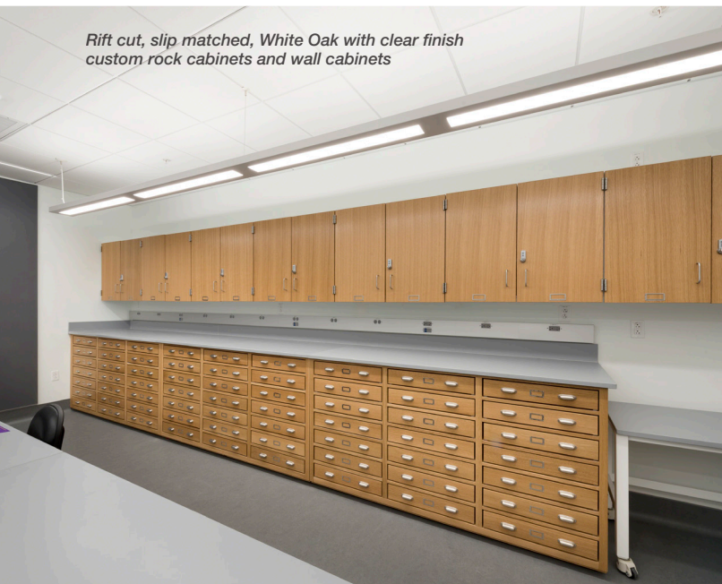
Rift cut, slip matched, White Oak with clear finish custom rock cabinets and wall cabinets

All of our base cabinets are available with heavy-duty locking casters providing convenient storage and mobility. Reconfigure the storage space as your tasks change for maximum flexibility.