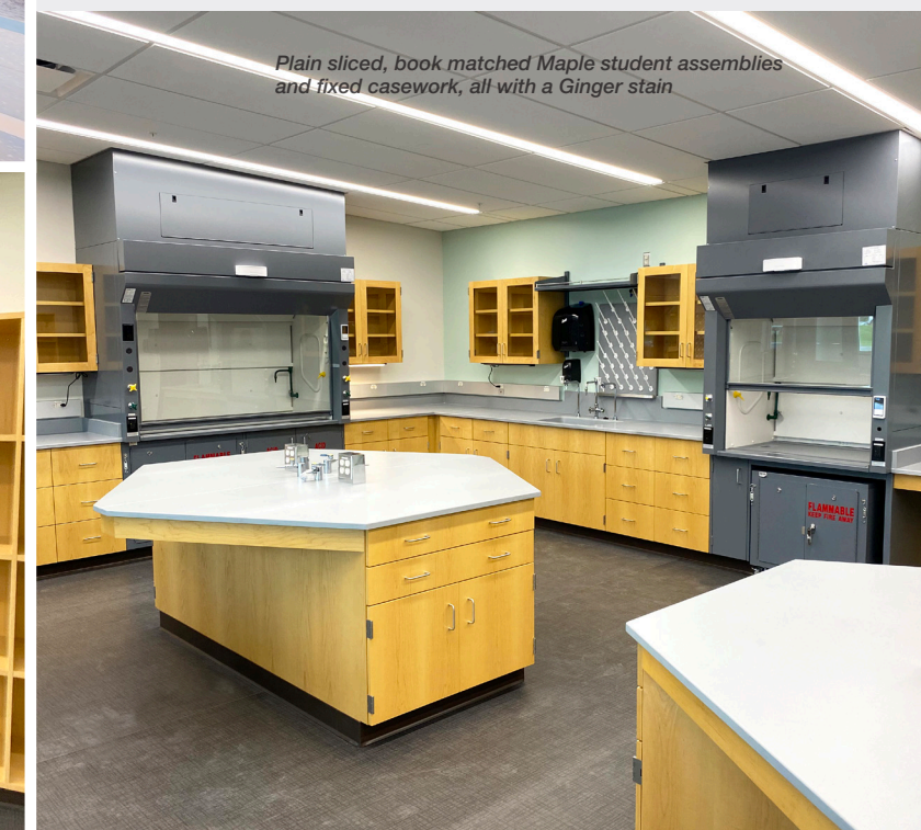
Plain sliced, book matched Maple student assemblies and fixed casework, all with a Ginger stain