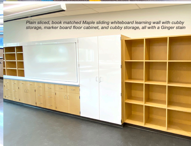
Plain sliced, book matched Maple sliding whiteboard learning wall with cubby storage, marker board floor cabinet, and cubby storage, all with a Ginger stain

To enhance the learning experience for instructors and students we can design custom workstations to meet the special needs of your classroom. Complete the assemblies with sinks, electrical, plumbing fixtures, and accessories.