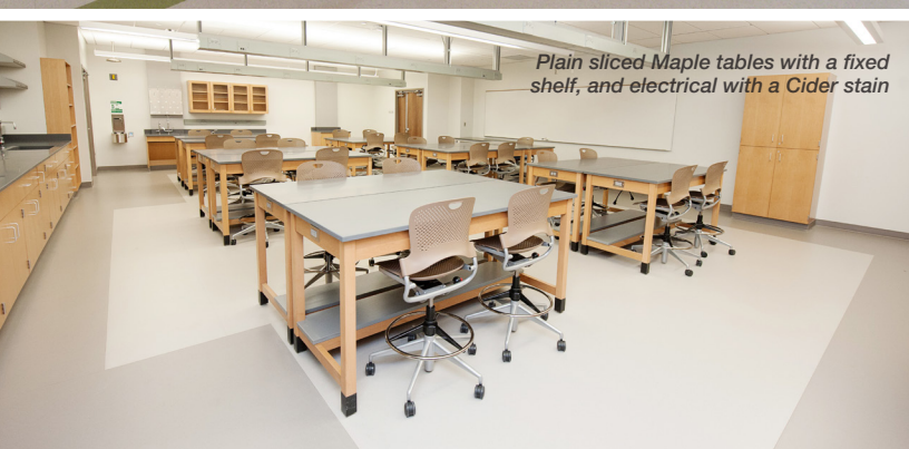
Plain sliced Maple tables with a fixed shelf, and electrical with a Cider stain