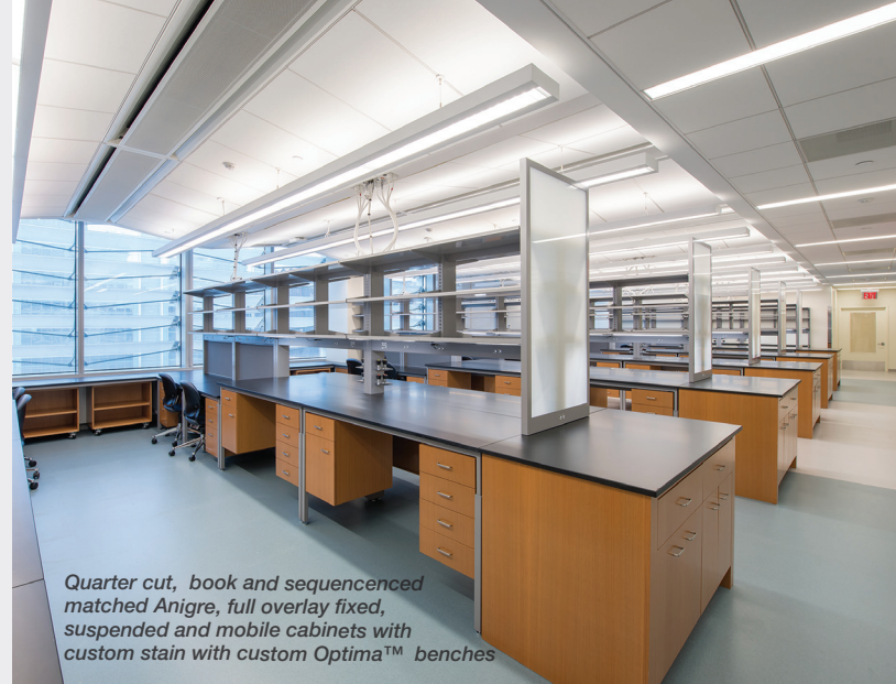
Quarter cut, book and sequenced matched Anigre, full overlay fixed, suspended and mobile cabinets with custom stain with custom Optima™ benches